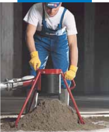
Batching a Topcem mix