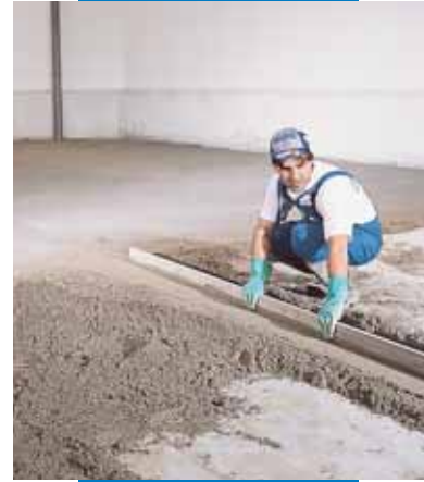
Preparing a levelling strip