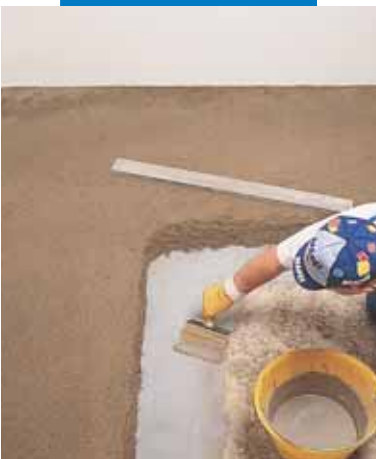
Spreading the anchoring slurry for bonded Topcem screeds