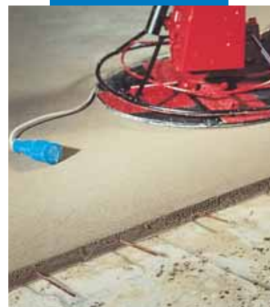
Power floating the surface of a Topcem screed