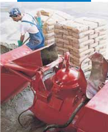
Mixing Topcem with an automatic pumping unit