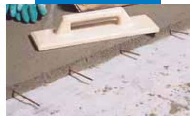
Detail of a Topcem screed with reinforcement rods