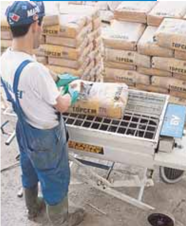
Mixing Topcem in a mini-batcher